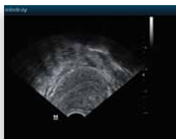
GYN transvaginal imaging

Evaluating patients in today's demanding environment takes innovative technology to speed up diagnosis with greater confidence. Mindray's DP-50 versatility expands your clinical utility while improving patient care.