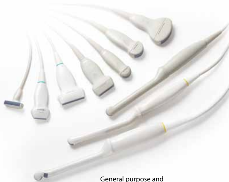
General purpose and specialty transducers