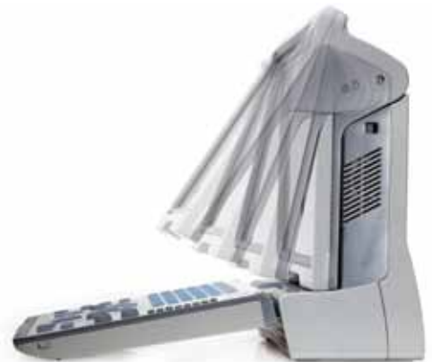
Tilting LCD display allows easy viewing