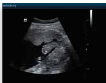
OB imaging – fetal foot

The DP-50 is engineered to help you get the information you need with an innovative high performance compact B/W system. The DP-50's X-treme engine and high speed processing power provides outstanding image quality and a complete information management solution. The insightful design reaches a wide range of clinical applications including abdomen, urology, OB/GYN, small parts, emergency, orthopedics, endocavity, and interventional medicine.