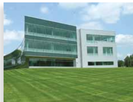
Mindray DS USA, Inc. U.S. headquarters in Mahwah, NJ

Learn how we can help you maximize your resources with some of the most advanced and affordable devices in the industry. For more information about Mindray products and services, visit www.na.mindray.com .