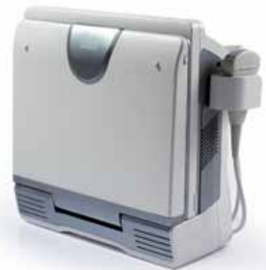
Compact and lightweight for enhanced mobility