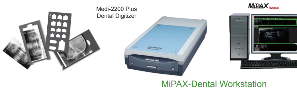
Medi-2200 Plus Dental Digitizer